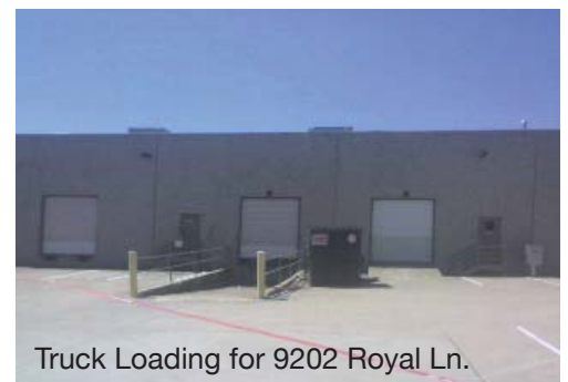
Truck Loading for 9202 Royal Ln.