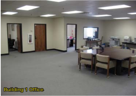
Building 1 Office