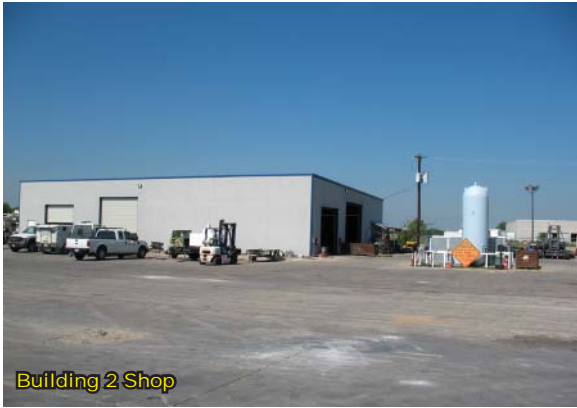
Building 2 Shop