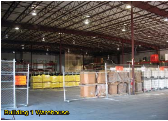
Building 1 Warehouse