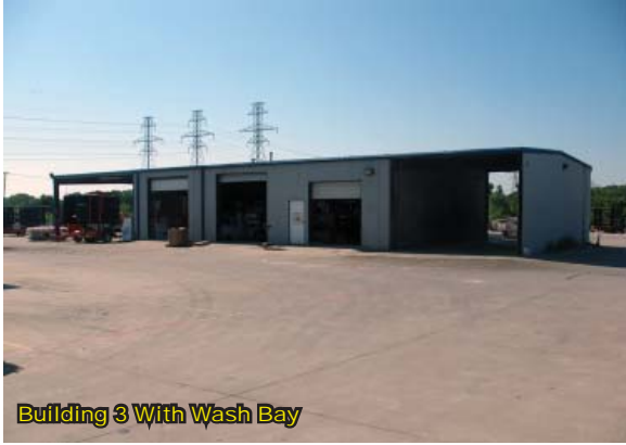
Building 3 With Wash Bay